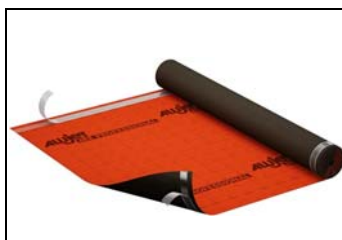
Fig. 1: ALUJET JKE Professional