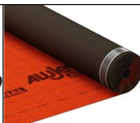
Fig. 2: JKE Professional