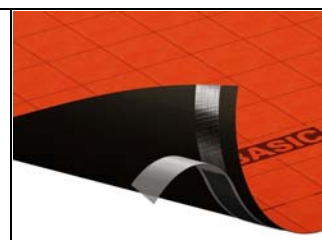
Fig. 3: Self-adhesive strip